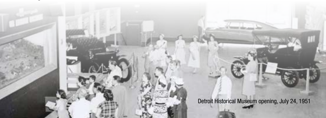
Detroit Historical Museum opening, July 24, 1951

In 2021, we marked our 100th anniversary! For more than 100 years, the Detroit Historical Society has encouraged historical scholarship, preservation and education. Today, the Society manages the Dossin Great Lakes Museum and Detroit Historical Museum while caring for a collection of more than 250,000 historical artifacts.