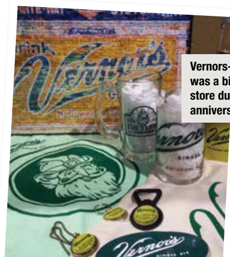
Vernors-themed merchandise was a big hit in our museum store during the 150 th anniversary celebration.