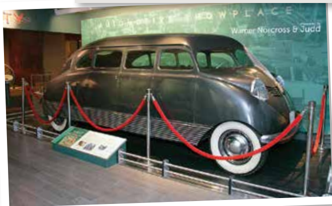
The Society's 1935 Stout Scarab went on display in August 2015 after being away on loan for many years.