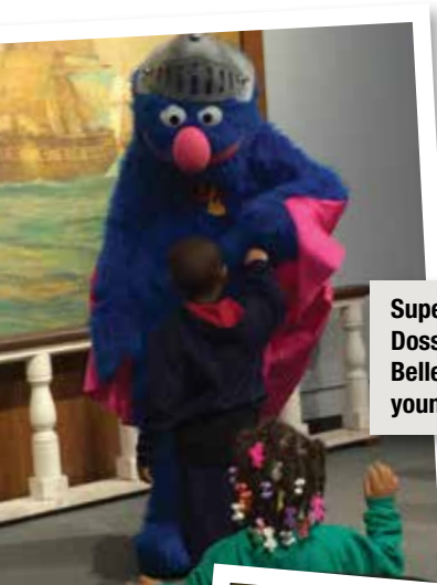
Super Grover made an appearance at the Dossin Great Lakes Museum for the 2015 Belle Isle Holiday Stroll, delighting many young guests.