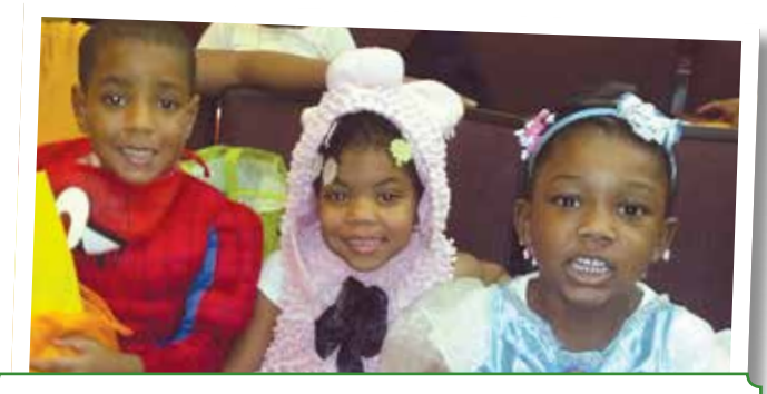
The popular Halloween-themed event, Treats in the Streets, returned in October after a year off due to the Detroit Historical Museum renovations.