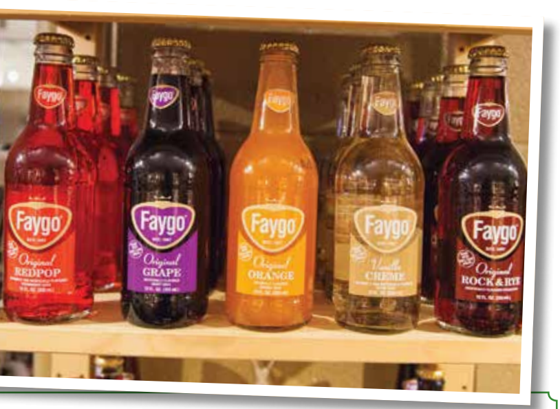
Shoppers can find a great mix of iconic Detroit brands like Faygo, along with an array of emerging brands, among the merchandise in the Society's two museum stores and online. Overall retail sales increased 12 percent in the past year.