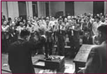
Jimmy Hoffa addresses union members at a Teamster rally.