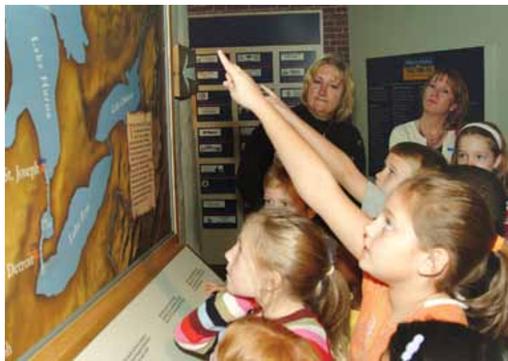
Students discover the many paths that early settlers followed in the Detroit Historical Museum’s Frontiers to Factories exhibit. The gallery will serve as a guide to a new online educational game set to launch in October.

“The website will include an interactive timeline that will orient students to key milestones in the city’s development and address significant social and cultural advances,” Voigt said. “In addition, teachers will be able download supplemental curriculum materials and activities that reinforce key social studies education standards.”