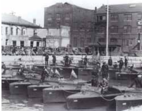
Law enforcement officials developed a fleet of patrol boats to combat bootlegging on the Detroit River.

Society staff is conducting the historical research, developing the timeline and writing the curriculum materials in concert with Eduweb, who is creating the game and developing the website. The project is scheduled to debut in October 2011.