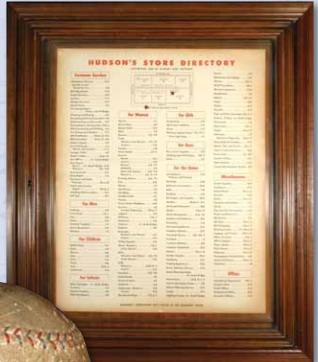
Hudson's store directory