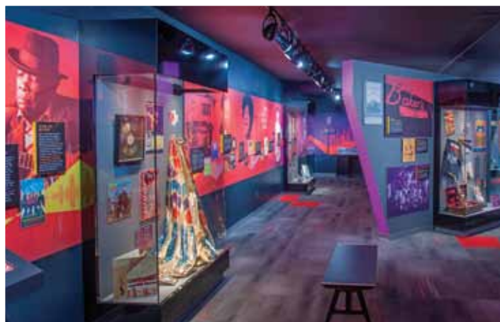
Kid Rock Music Lab