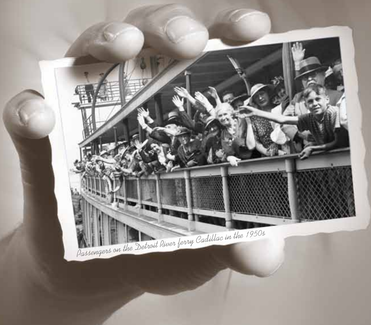
Passengers on the Detroit River ferry Cadillac in the 1950s

Dossin Great Lakes Museum Grand Re-Opening: May 18, 2013, Noon