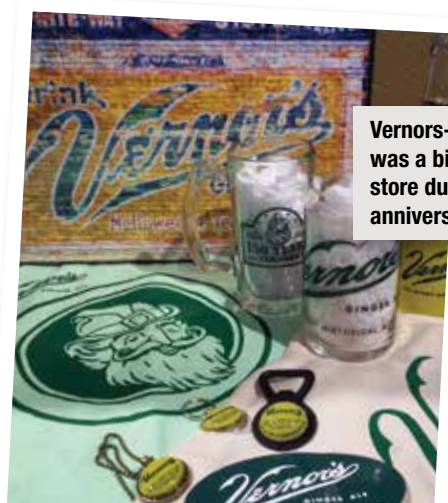
Vernors-themed merchandise was a big hit in our museum store during the 150 th anniversary celebration.