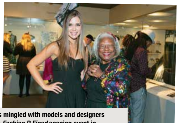
Guests mingled with models and designers during Fashion D.Fined opening event in September 2015 at the Detroit Historical Museum.