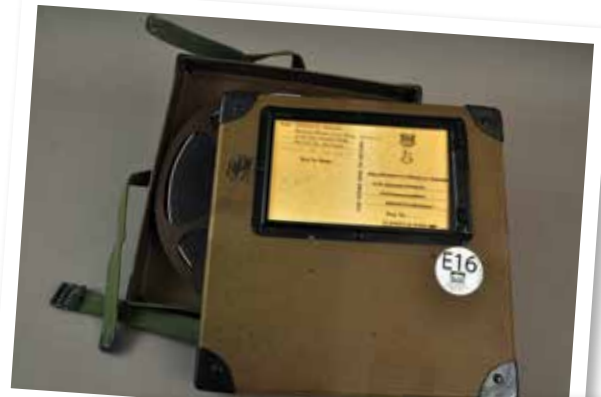
The Society's Detroit Video History Archive made many interesting and previously unavailable historical video clips viewable on our YouTube channel. The project was made possible by grants from the Institute of Museum and Library Services and the National Endowment for the Humanities.