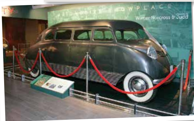
The Society's 1935 Stout Scarab went on display in August 2015 after being away on loan for many years.