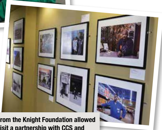
A grant from the Knight Foundation allowed us to revisit a partnership with CCS and produce Re-Documenting Detroit with student photographers.