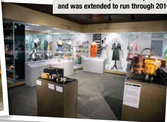
Fashion D.Fined opened in September 2015 and was extended to run through 2016.