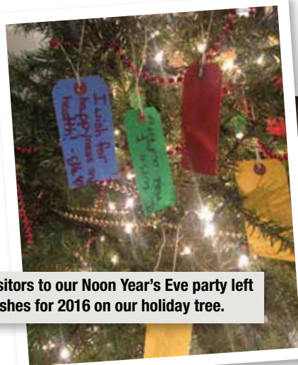
Visitors to our Noon Year's Eve party left wishes for 2016 on our holiday tree.