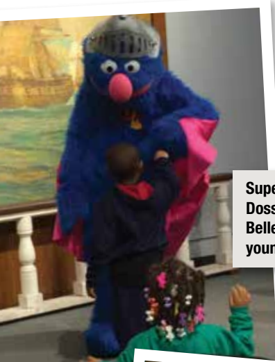
Super Grover made an appearance at the Dossin Great Lakes Museum for the 2015 Belle Isle Holiday Stroll, delighting many young guests.