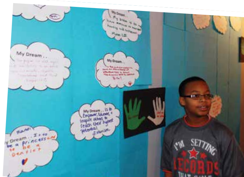
A child attending the Detroit Historical Museum's Martin Luther King Day holiday program places his artwork on the "dream board."