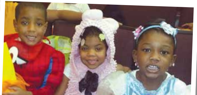
The popular Halloween-themed event, Treats in the Streets, returned in October after a year off due to the Detroit Historical Museum renovations.