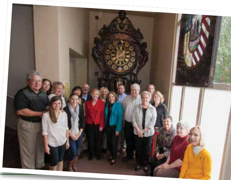
Members of the Meier family returned to the Detroit Historical Museum for the October re-dedication of the newly restored Meier Clock.