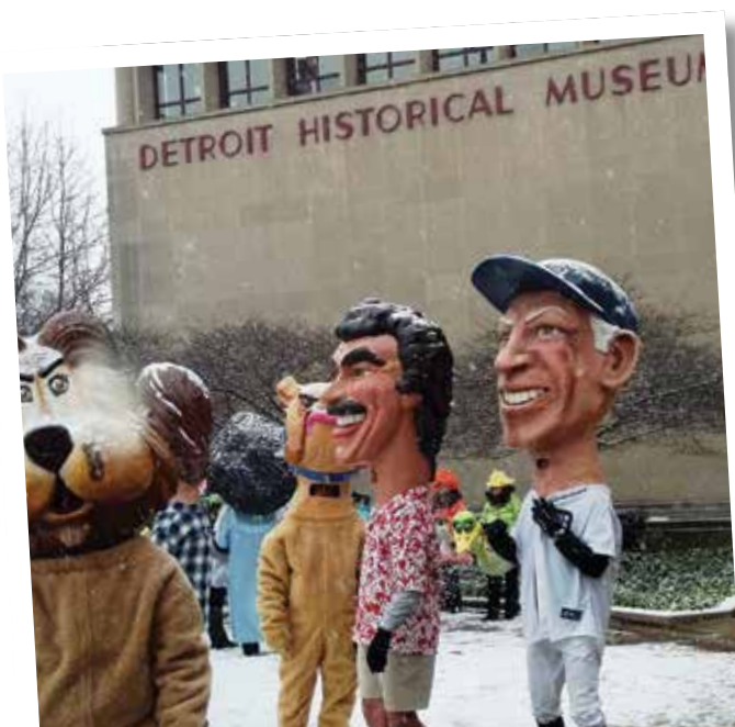
The "Big Head Corps" gathered on Legends Plaza to await their entry into America's Thanksgiving Parade. The Parade Company hosted breakfast for these volunteers that morning at the Detroit Historical Museum.