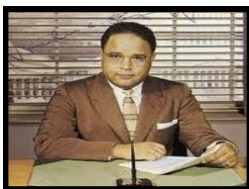
Charles C. Diggs – The first African American Congressman elected