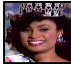
Carole Anne-Marie Gist In May of 1990, Carole Anne-Marie Gist became the first African American to win the Miss USA title.