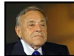
Melvin Jefferson – The city of Detroit's first Black fire commissioner

Celebrate our honorees of African American achievement!