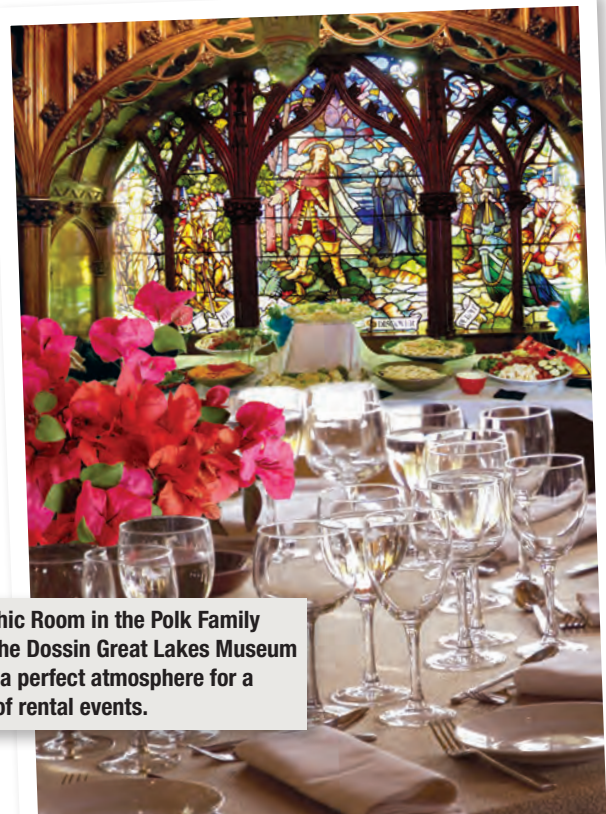
The Gothic Room in the Polk Family Hall at the Dossin Great Lakes Museum creates a perfect atmosphere for a variety of rental events.