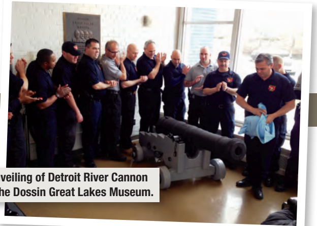
The unveiling of Detroit River Cannon #6 at the Dossin Great Lakes Museum.

additional 4,103 items. These items are things that have been in our possession but were not formally accessioned when they were donated. Many of these items date back as far as the 1950s.