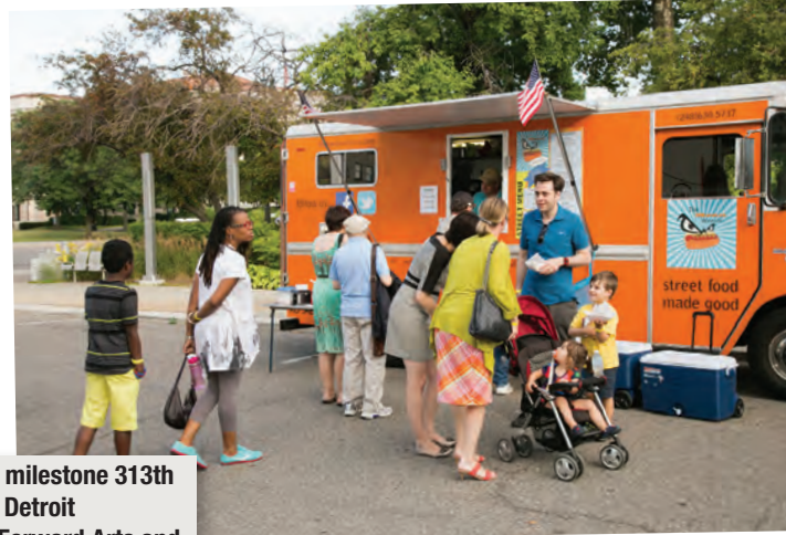
The Detroit 313 Society hosted Detroit's milestone 313th birthday party in Midtown in July at the Detroit Historical Museum, in partnership with Forward Arts and their Detroit Love celebration. The event featured food trucks, music and dancing on Legends Plaza.