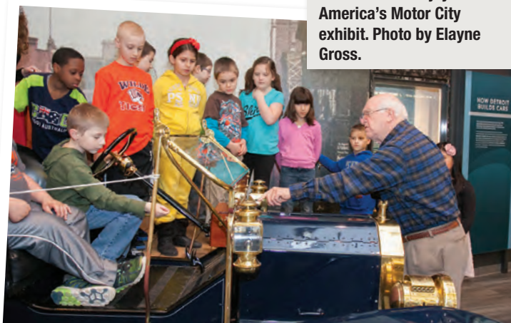
A school tour enjoys the America's Motor City exhibit.